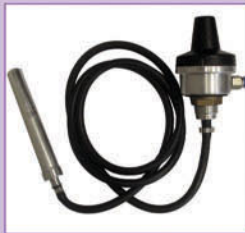
(Top Outlet Only)