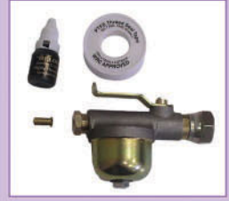
(Bottom Outlet Only)