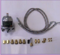
(Top Outlet Only)